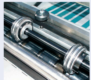
Rotating length slitting